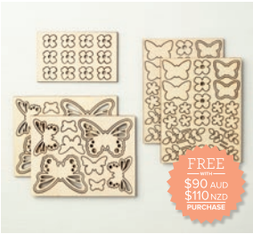
BUTTERFLY ELEMENTS • p. 8 149711