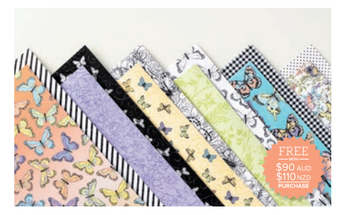
BOTANICAL BUTTERFLY DESIGNER SERIES PAPER • p. 9 149622