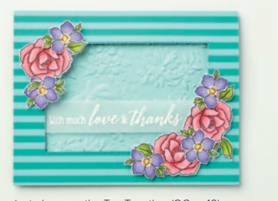
This project also uses the Tea Together (OC p. 49) and Tropical Chic (AC p. 121) Stamp Sets.