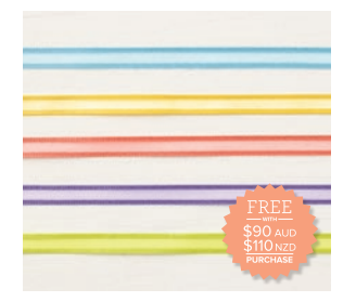
ORGANDY RIBBON COMBO PACK • p. 7 149623