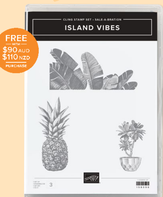
INK. ISLAND VIBES • 158096 FREE!

3 cling stamps (suggested clear blocks: d, e)