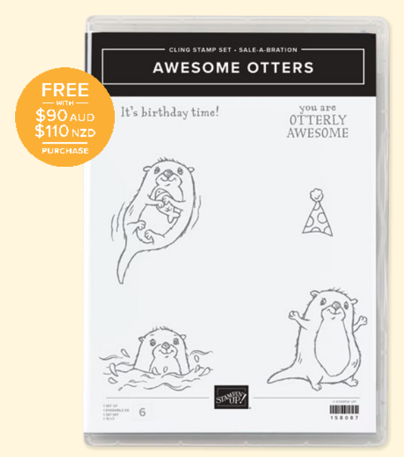
AWESOME OTTERS • 158087 FREE!

6 cling stamps (suggested clear blocks: a, b, d, g)